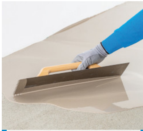
Ultraplan Contract application