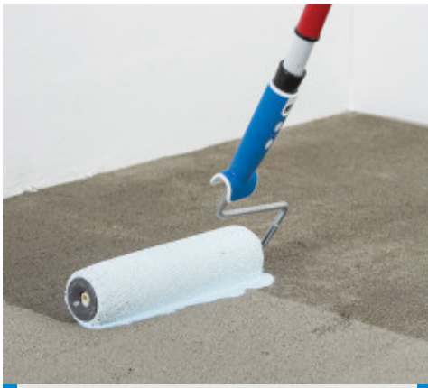
Primer application on the substrate